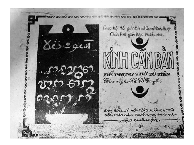
Photo 3 Textbook for Laypersons (Edited by Phuoc Nhon Village Doctrine Committee 1971)

village god and lineage deities. The laity can only connect to po Auluah or the deities through priests as their medium.<sup>13)</sup>