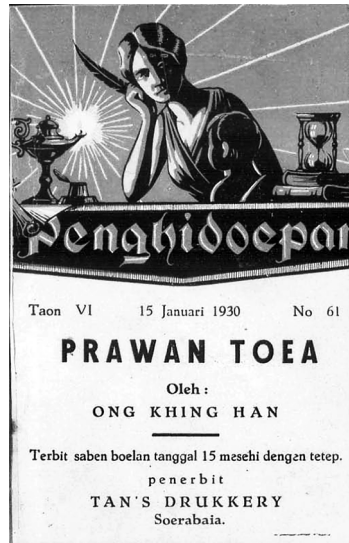
Fig. 1 Penghidoepan Cover Illustration 1930