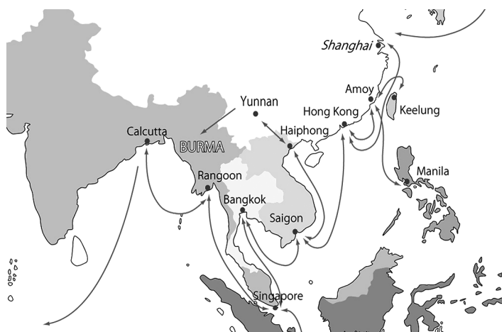
Fig. 1 The Route of Couriers in East and Southeast Asia in 1931