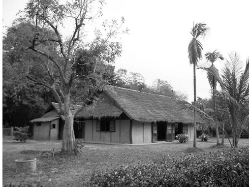
Photo 4 Hồ Chí Minh Memorial House in Ban Nong On, Udon Thani