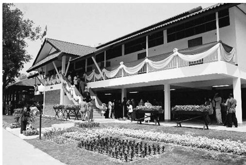
Photo 3 Thai-Vietnamese Friendship Village, Ban Na Chok (Ban May), Nakhon Phanom

Friendship Village does not actually have a direct connection to Hồ Chí Minh's sojourn in Siam—it was not where he resided, neither was it used as a revolutionary base. Nonetheless, it was inaugurated by the Thai and Vietnamese prime ministers in February 2004, after the first Thai-Vietnamese joint cabinet in Đà Nẵng. The Friendship Village was built to symbolize the understanding, mutual trust, and development of relations and cultural cooperation between the two countries after the Cold War. It also signifies the recognition of the Việt Kiều by the Thai government and their integration into Thai society.