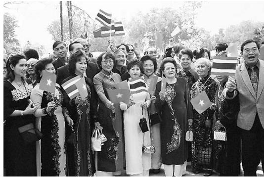
Photo 5 Việt Kiều in Thailand, Vietnamese, and Thai on the Occasion of the Opening Ceremony of the Thai-Vietnamese Friendship Village, Ban Na Chok, Nakhon Phanom (Photo by a Việt Kiều, February 21, 2004)

the Friendship Village, Hồ Chí Minh's memorial houses, and the Việt Kiều are considered as a cultural bridge linking the people of the two countries and a strong base of the Thai-Vietnamese relationship (Thanyathip 2004a).