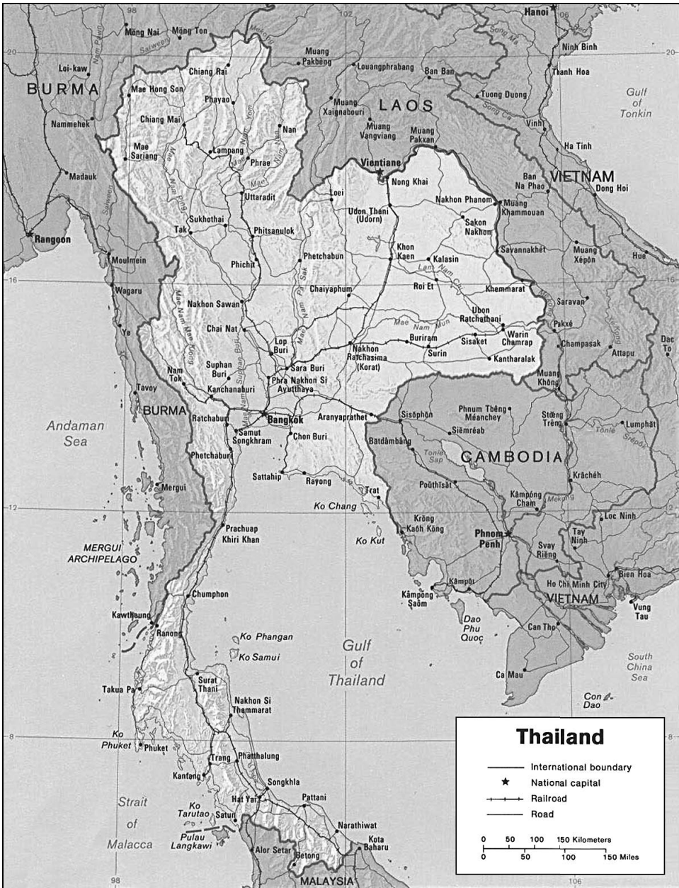
Map 2 Map Showing the Locations of Districts and Provinces