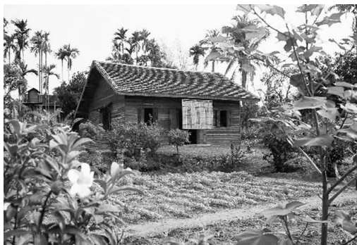
Photo 2 Hồ Chí Minh Memorial House in Ban May (Now Called Ban Na Chok), Nakhon Phanom

The Thai-Vietnamese Friendship Village in Ban Na Chok was built after the Hồ Chí Minh memorial house. It includes a small museum recounting Hồ Chí Minh's brief stay in Siam and the itinerary of his journey to other countries after he left Vietnam in 1911. The