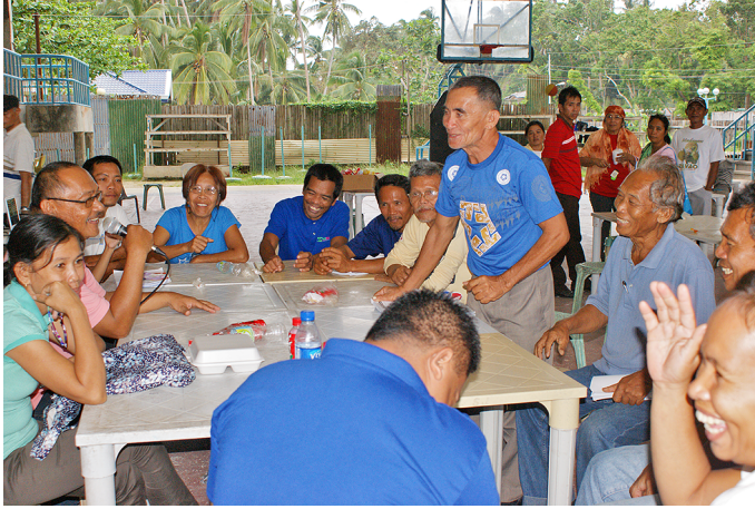
Fig. 1 Discussion under Way in a LPRAP Workshop

Sangguniang Panlalawigan (municipal council): the Sangguniang Panlalawigan must approve the list of priority projects. The seventh step is submission of the list of local priority poverty reduction projects: the endorsed list must be submitted to relevant institutions such as the National Anti-Poverty Commission and scrutinized (DBM-DILG-DSWD-NAPC Joint Memorandum Circular No. 1 2012, 4–7).