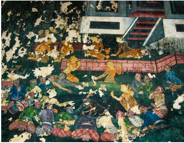
Fig. 2 Cockfighting Scene from Inao Mural in Wat Somanat