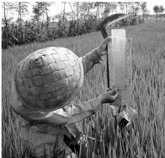
Photo 1 USA Farmer Rain Gauge in Farmer's Field, Wareng, Gunungkidul