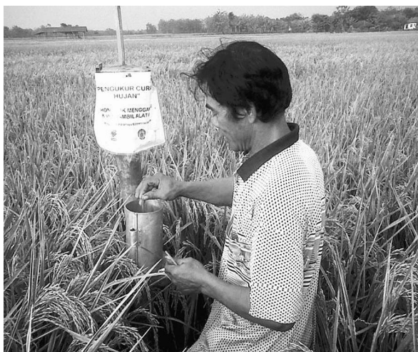
Photo 2 A Farmer in Indramayu Measuring Rainfall Using a Cylindrical Farmer Rain Gauge